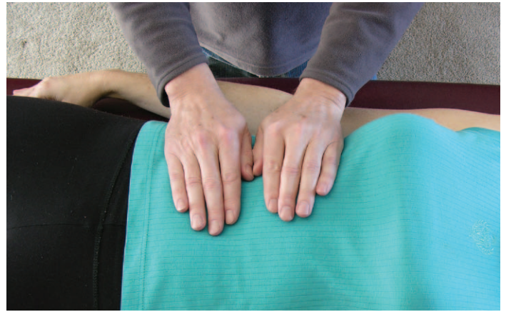
Torso Position 2