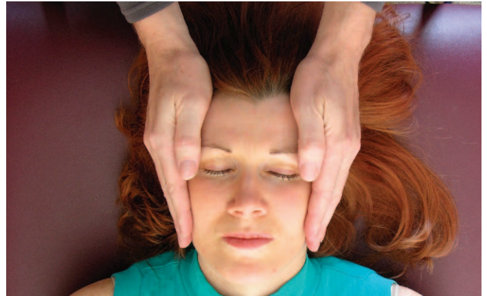
Head Position 2