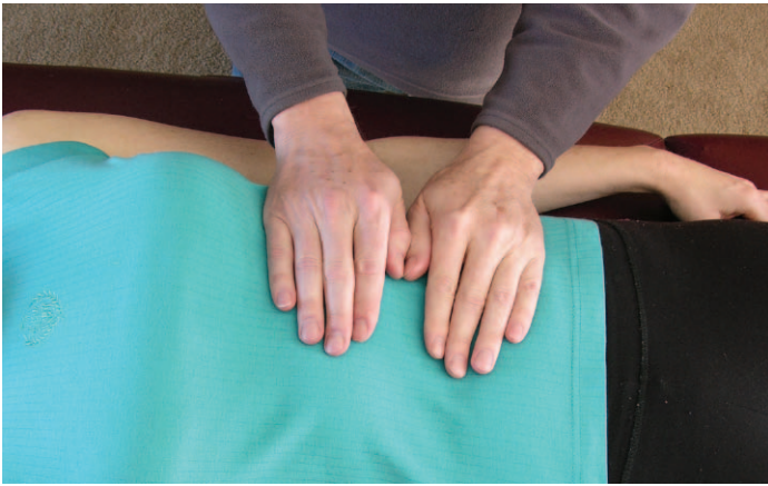
Torso Position 1