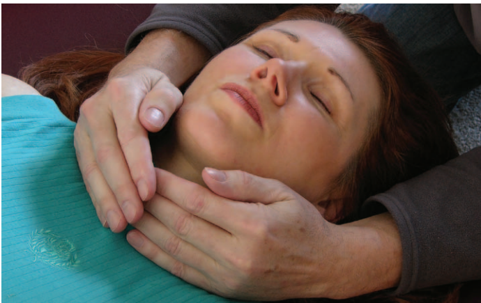
Head Position 3