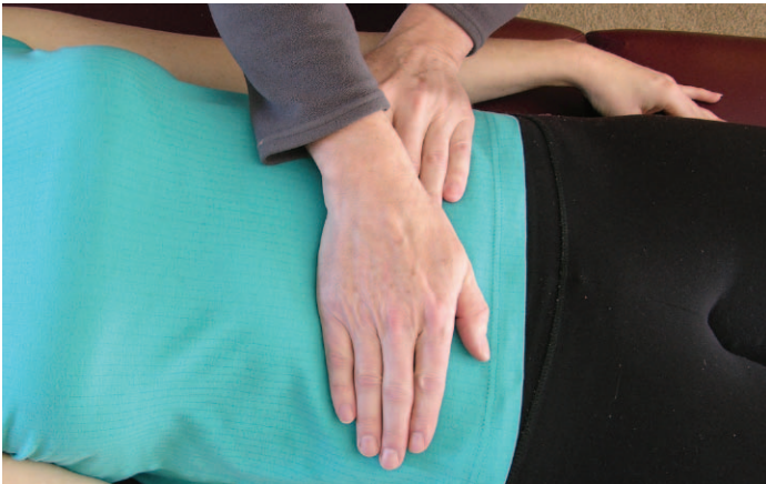
Torso Position 3