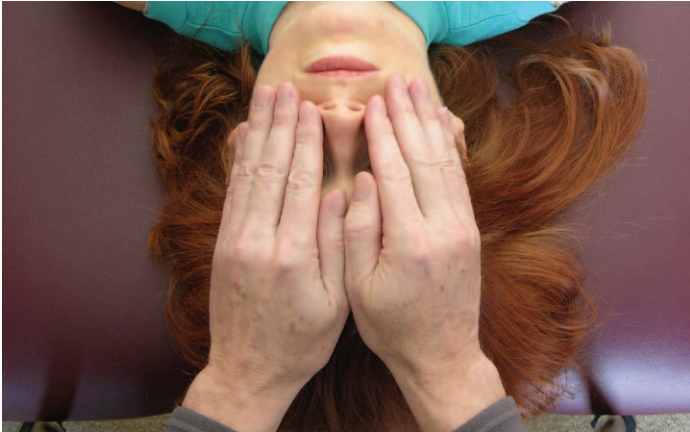
Head Position 1