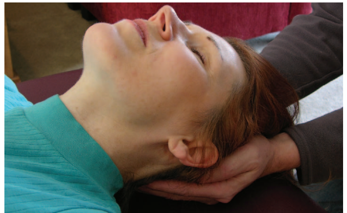
Head Position 4 - Optional